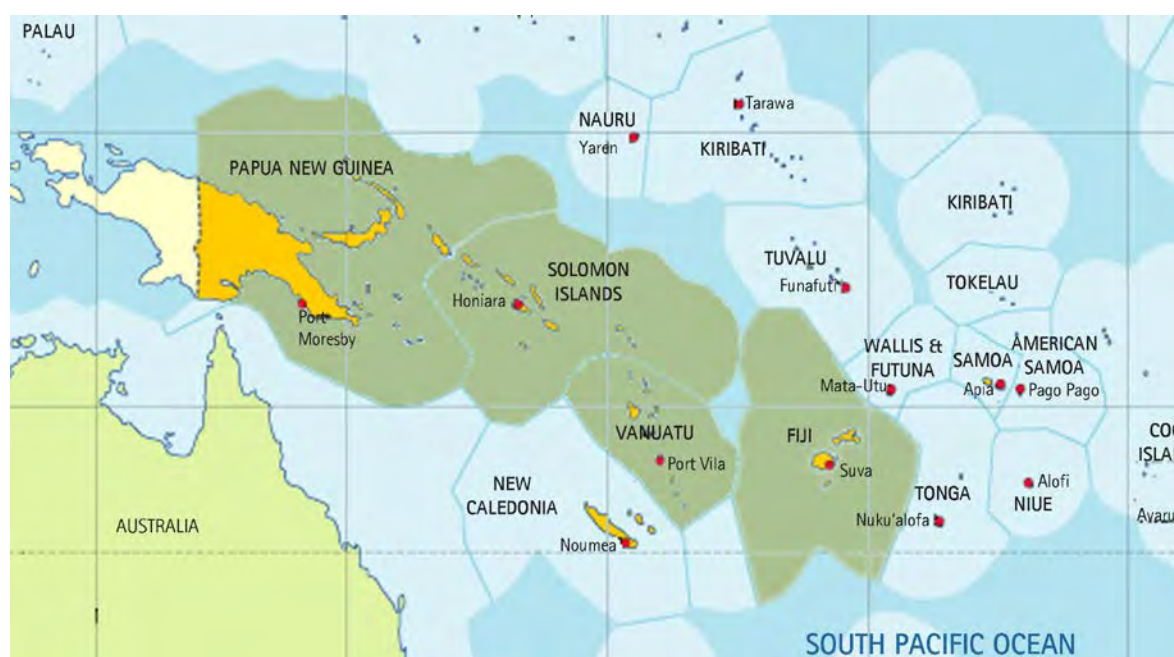
Map 1.1: Location of Papua New Guinea within Melanesia

Deforestation and forest degradation account for approximately 17% of global greenhouse gas emissions – more than the entire global transport sector. 4 Since 2005,